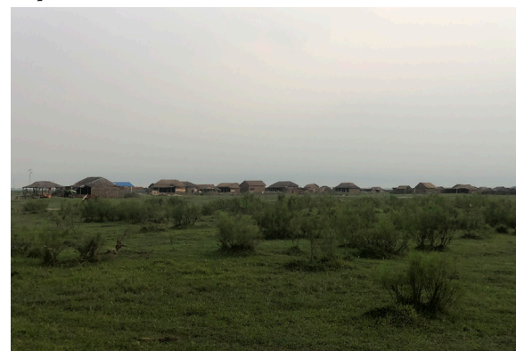
Figure 2. Gobargada village

community employs customary techniques to evaluate the likelihood of flood occurrence by closely monitoring the attributes of the adjacent river. The community's elderly members spearhead informal organizations that identify suitable relocation sites and initiate the relocation of households. This relocation process typically lasts between a few months and three years and involves intense discussions among community members before a decision is made.